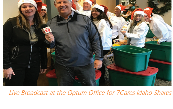
Optum Staff volunteering at the phone bank for 7Cares Idaho Shares

Live broadcast at the Boise Tree Lighting Celebration for 7Cares Idaho Shares