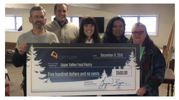
Donation to the Upper Valley Food Pantry in Saint Anthony, ID.