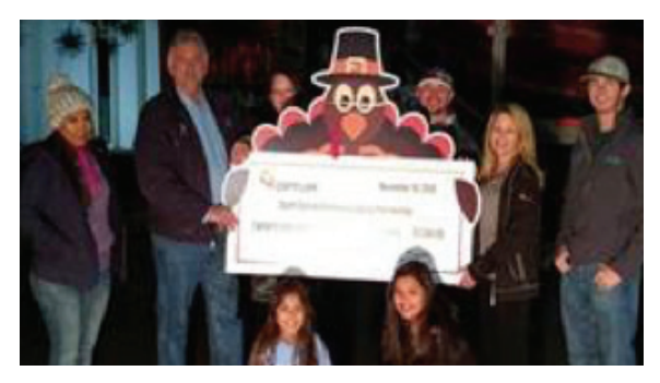
Donation to the S. Central Community Action Partnership